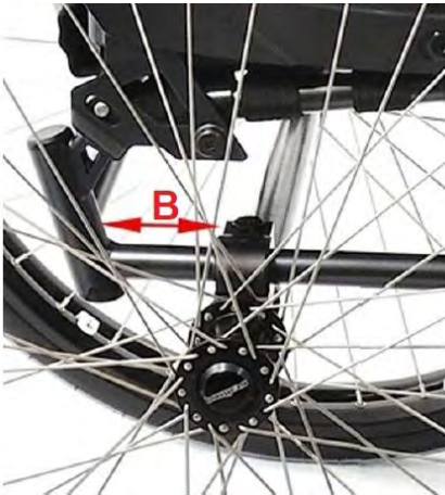
Rear Axle Adjustment