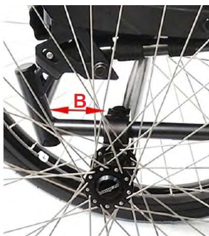
Rear Axle Adjustment