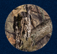
Mossy Oak® Breakup® Country™