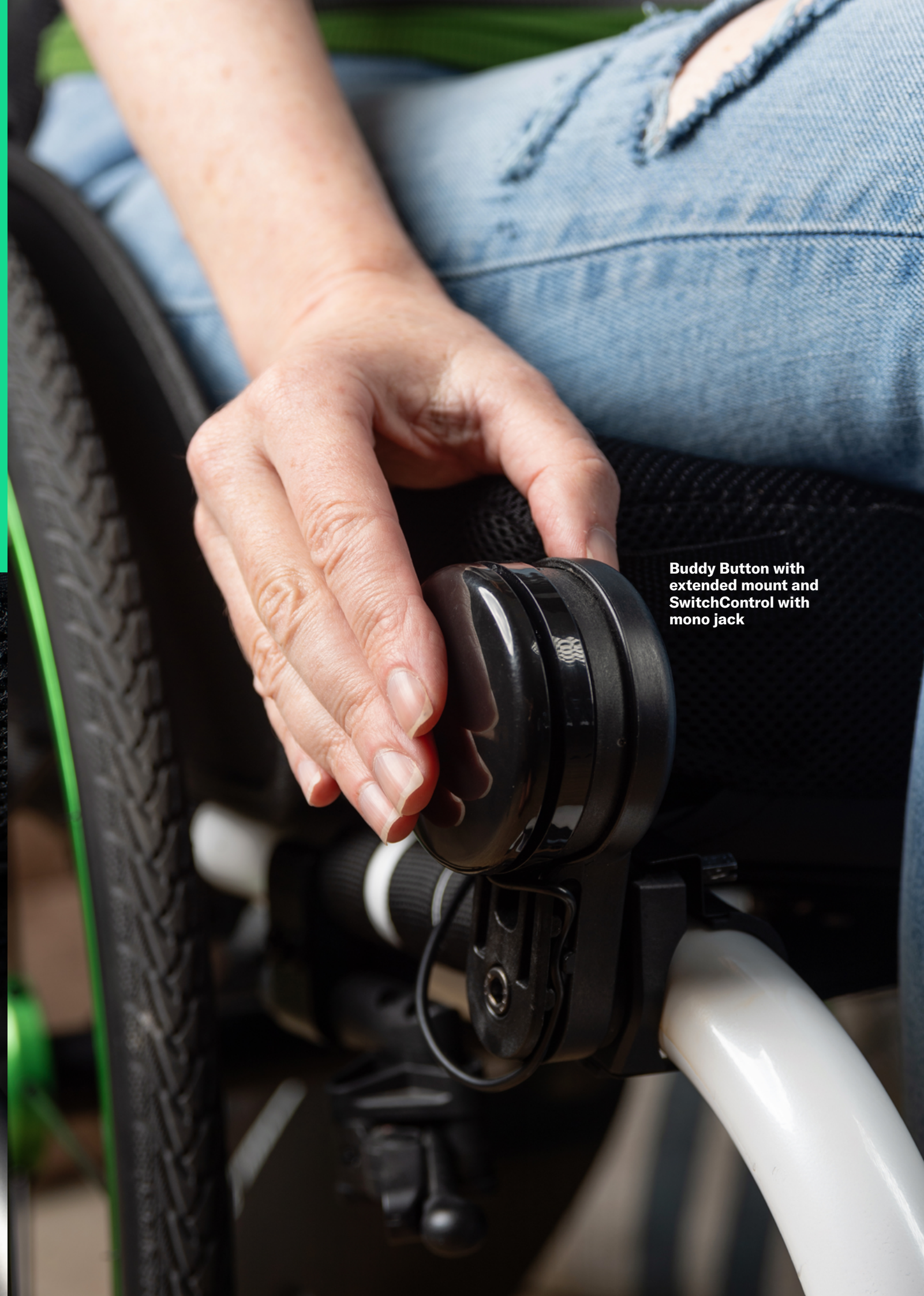
Buddy Button with extended mount and SwitchControl with mono jack